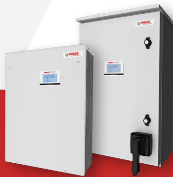
Phase Perfect® Digital Phase Converter

Typical HVAC System Installation, Estimated Annual Savings with Phase Perfect® versus Rotary: